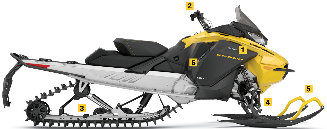
BACKCOUNTRY SPORT 146 600 EFI SHOWN

Crossover-specific suspension uses best principles of the rMotion™ trail and tMotion™ mountain skis for confident cornering and agile boondocking.