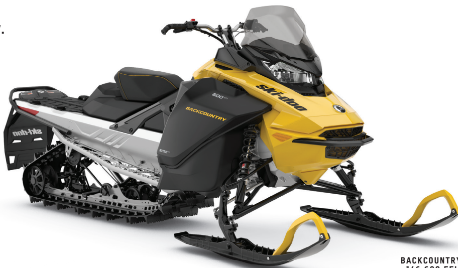
BACKCOUNTRY SPORT 146 600 EFI SHOWN

For the value-oriented 50-50 rider wanting an advanced platform and modern engine technology.