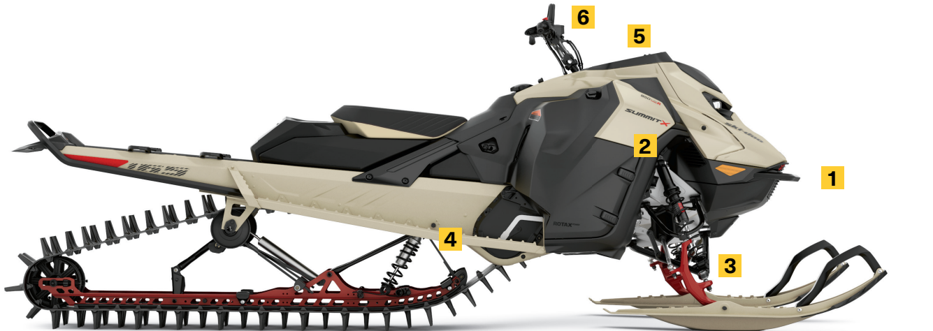
SUMMIT X 165 850 E-TEC TURBO R SHOWN

Highest-quality KYB® lightweight high-pressure gas shocks front and rear. Rebuildable and revalvable.