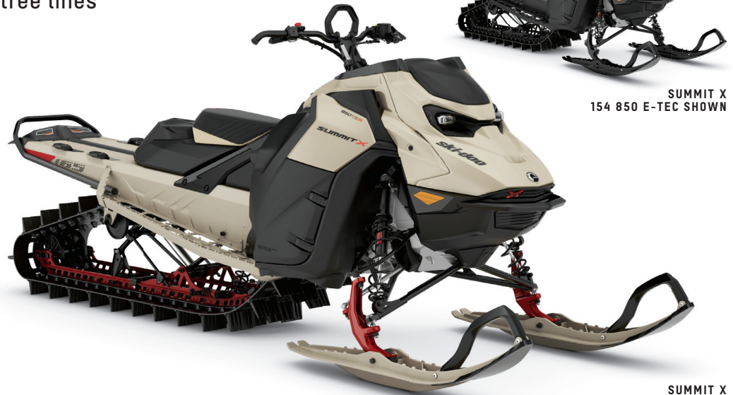
SUMMIT X 154 850 E-TEC SHOWN

Longer climbs, tighter tree lines and deeper powder.