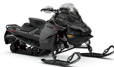
MXZ X 600R E-TEC SHOWN

High-performance with race-ready features for the most demanding rider.