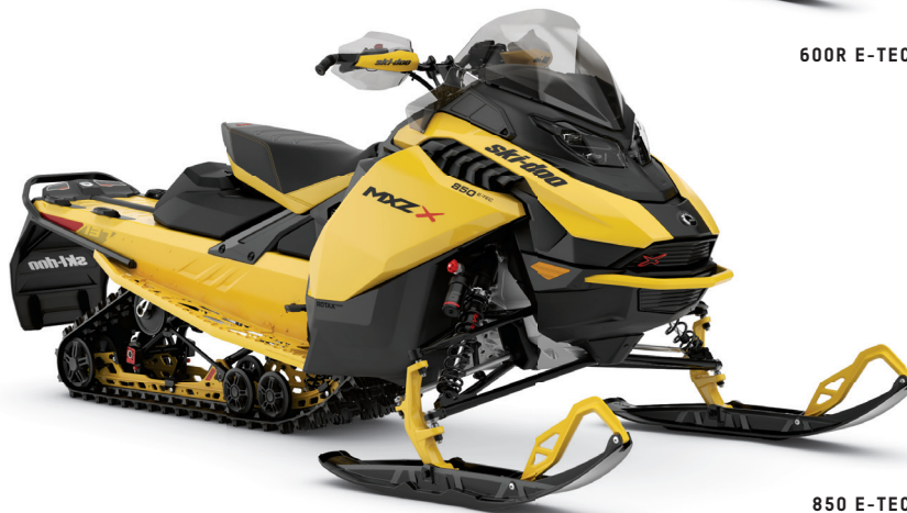
MXZ X 850 E-TEC SHOWN