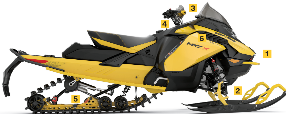
MXZ X 850 E-TEC SHOWN

A high-resolution infotainment system that puts an interactive, informative and customizable experience that's both seamless and simple right at your fingertips.