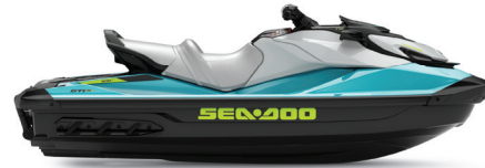
GTI™ SE 170