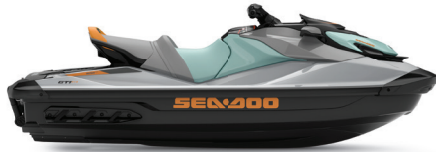
GTI™ SE 130