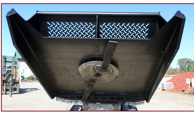
Model 7201 Blade Carrier Assembly