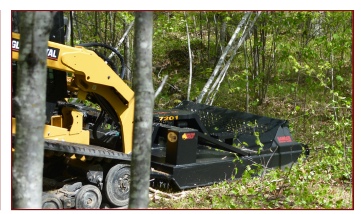
Model 7201 Clearing Brush