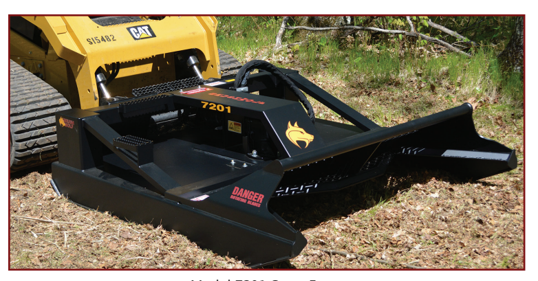
Model 7201 Open Front