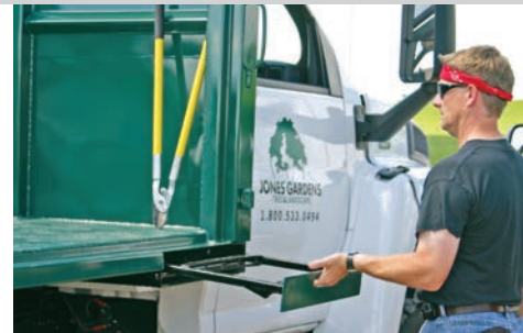
Upper tailgate swings completely away and latches securely in place when needed.