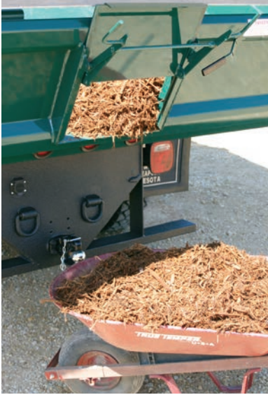
Sliding center patchgate controls material flow.