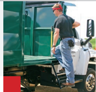
Swing-out door with convenient stow-away ladder offers quick and easy accessibility.