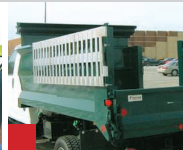
Optional sliding center patchgate controls material flow.