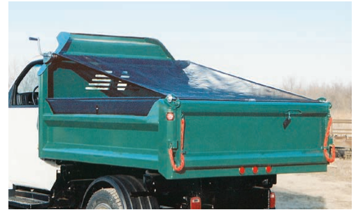
Fully integrated load cover option exemplifies convenience.