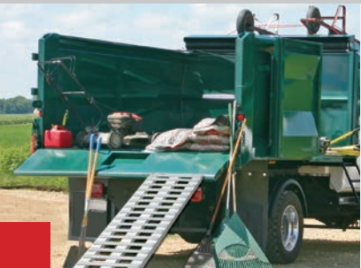
Removable upper tailgate doubles as a ramp for easy loading/unloading of materials and tools.