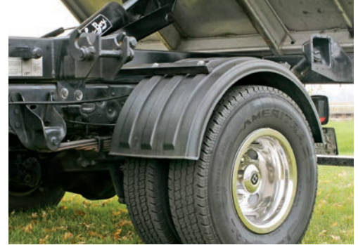
Poly Fenders are available in 16" and 22" Single Axle Fender Kits.