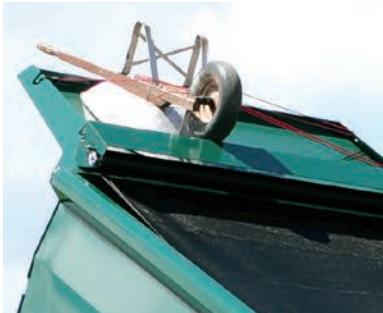
Full weld-on Cabshield with accommodations for tarp.