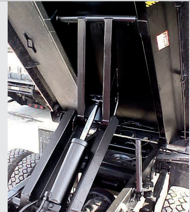
Crysteel Lo-Boy hoists are made in the USA and rated by the NTEA.