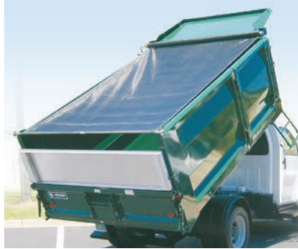
Standard Manual Tarp or Spring Tension Tarp.