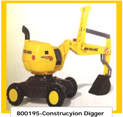
800195-Construction Digger New Holland 3+