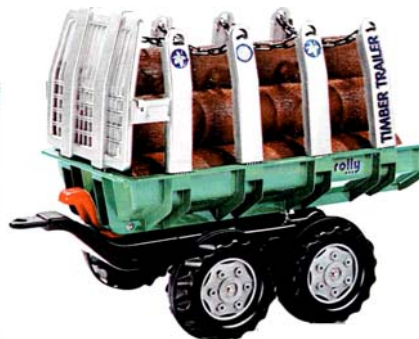
800081 - Timber Trailer 3+ ◆ Twin axle, green, automatic locking ◆ bi-axes, vert, verrouillage automatique