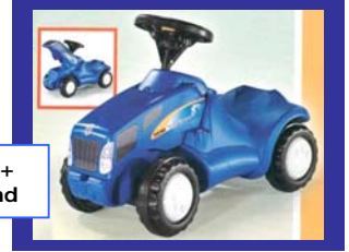
800002 - 1+ New Holland