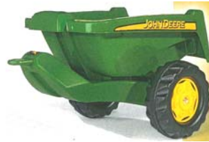
800067 - Trailer JD Green 2+