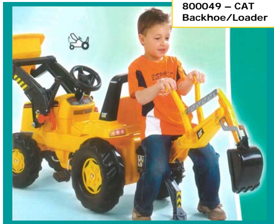
800049 – CAT Backhoe/Loader