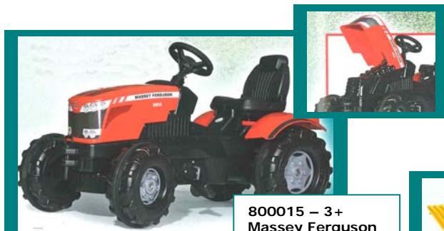
800015 - 3+ Massey Ferguson