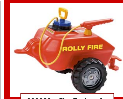
800093 – Fire Tanker 3+ ◆ with pump and spray nozzle ◆ avec pompe et arroseur