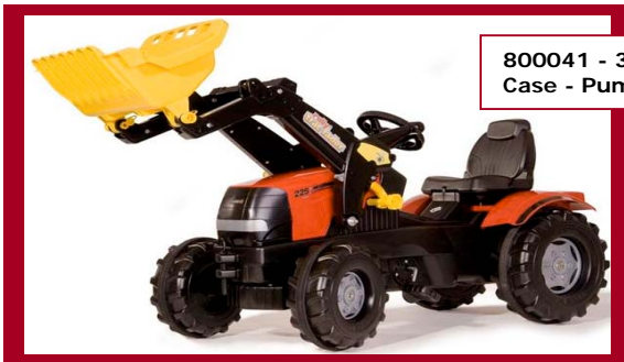
800041 - 3+ Case - Puma