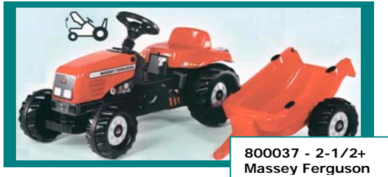
800037 - 2-1/2+ Massey Ferguson