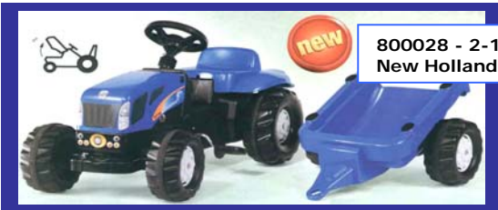
new 800028 - 2-1/2+ New Holland