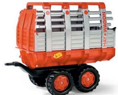
Hay Wagon - 3+ 800082 - Green 800083 - Red ◆ Single locking, automatic locking ◆ mono-axe, verrouillage automatique