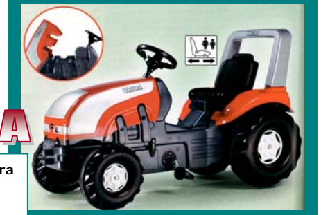
800031 - 3+ Valtra ◆ Hood can open ◆ Capot ouvrant