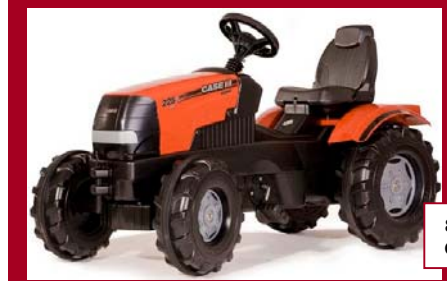
800042 - 3+ Case - Puma