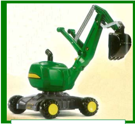
800061 – Digger John Deere 3+