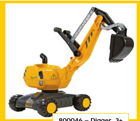
800046 – Digger 3+