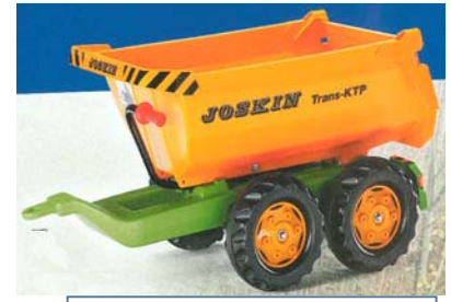
800190 - Dumper - Orange ♦ Tripper, twin axle 3+