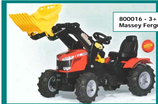
800016 - 3+ Massey Ferguson