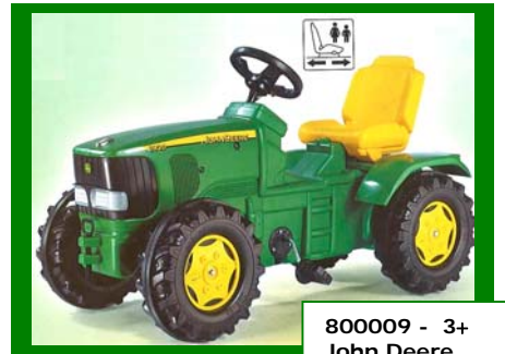
800009 - 3+ John Deere