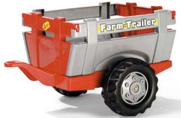
800091–Farm Trailer Red 3+ 800094–Farm Trailer Green