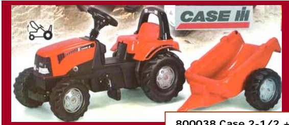
800038 Case 2-1/2 +