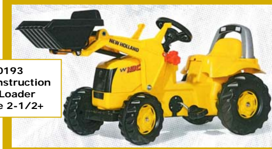
800193 Construction w/Loader Age 2-1/2+