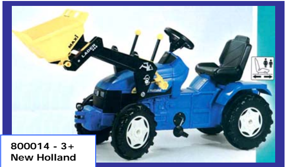
800014 - 3+ New Holland