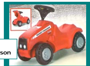
800007-1+ Massey Ferguson