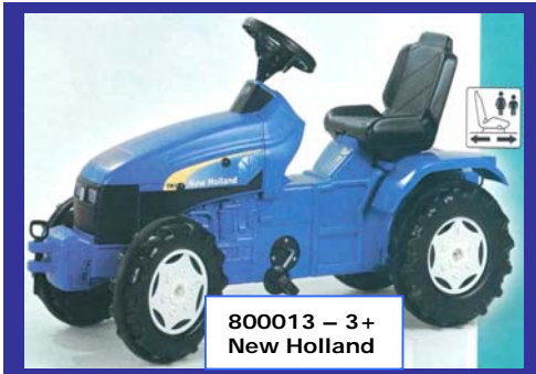
800013 - 3+ New Holland