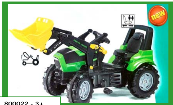
800022 - 3+ Deutz Agrotion