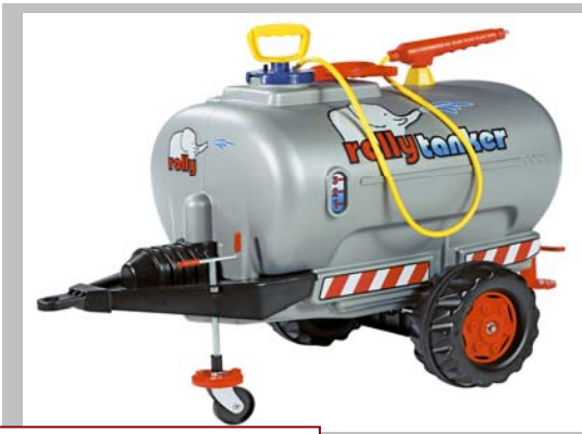
800092 - Tanker/sprayer ◆ with pump and spray nozzle 3+ ◆ avec pompe et arroseur