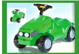
800000 - 1+ Deutz - Aaotron