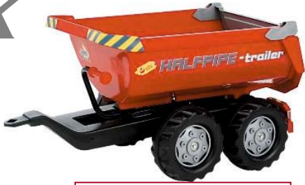
800075 – Dumper - Red ♦ Tripper, twin axle 3+ ♦ remorque basculante, bi-axes