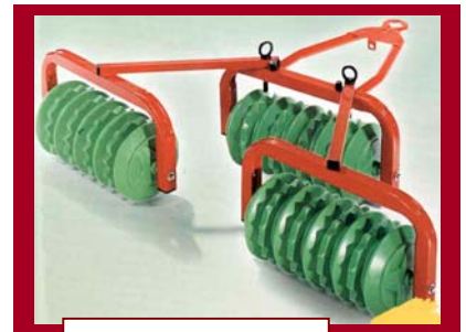
800079 – Roller 3+