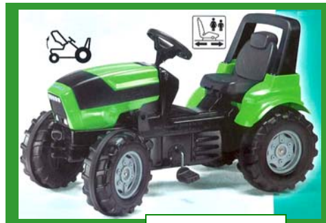
800021 - 3+ Deutz Agrotion