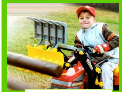
8000059–Timber - 3+ Grapple and Bucket