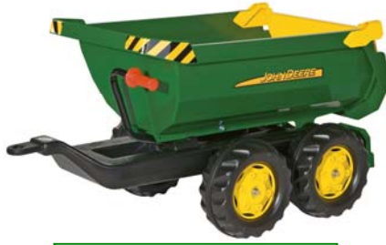
800078 - Dumper - Green ♦ Tripper, twin axle 3+