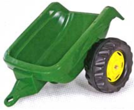
Roly Kid Trailer 800180 Red 800181 Green 800182 Green JD 800183 Blue