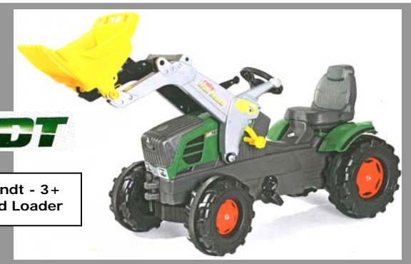
800035 Fendt - 3+ Tractor and Loader