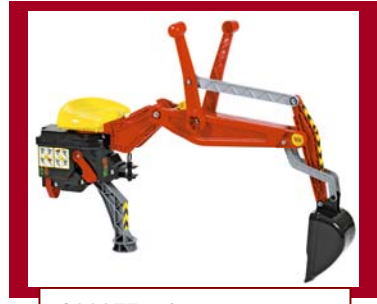
800077 – 3+ Excavator Attachment ♦ with locking mechanism ♦ avec verrouillage, set d' installation