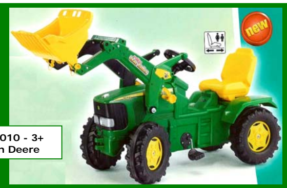
800010 - 3+ John Deere