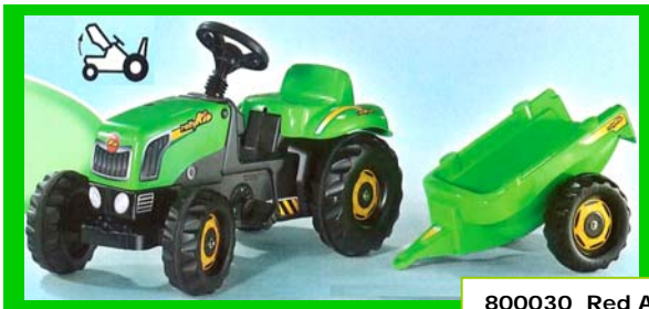
800030 Red Age 2-1/2+ 800029 Green with Horn / avec klaxon int  ar  