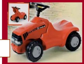
800003 - 1+ Mini Case