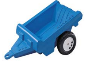
800067 - Trailer Red 800066 - Trailer Blue 2+