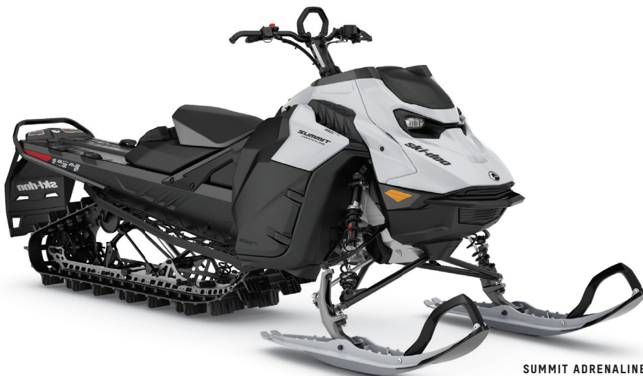
SUMMIT ADRENALINE 154 850 E-TEC SHOWN

An excellent deep snow machine for any rider.