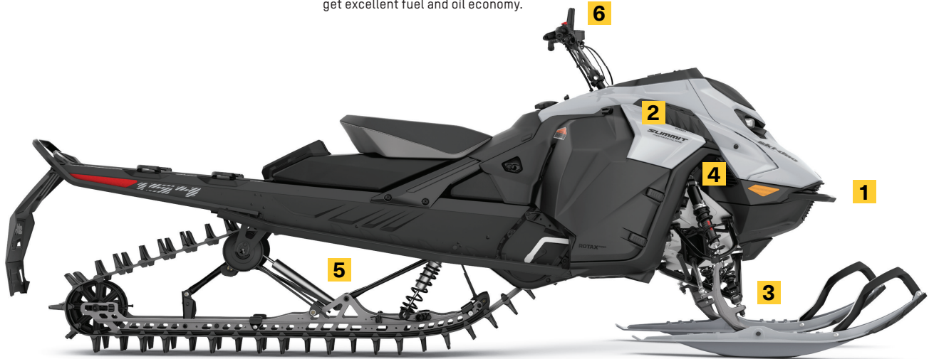
SUMMIT ADRENALINE 154 850 E-TEC SHOWN

Lightweight alloy spindle with revised geometry and new ski stopper to reduce ski drag for more predictable handling and a confidence-inspiring ride in technical sidehills and rough terrain.