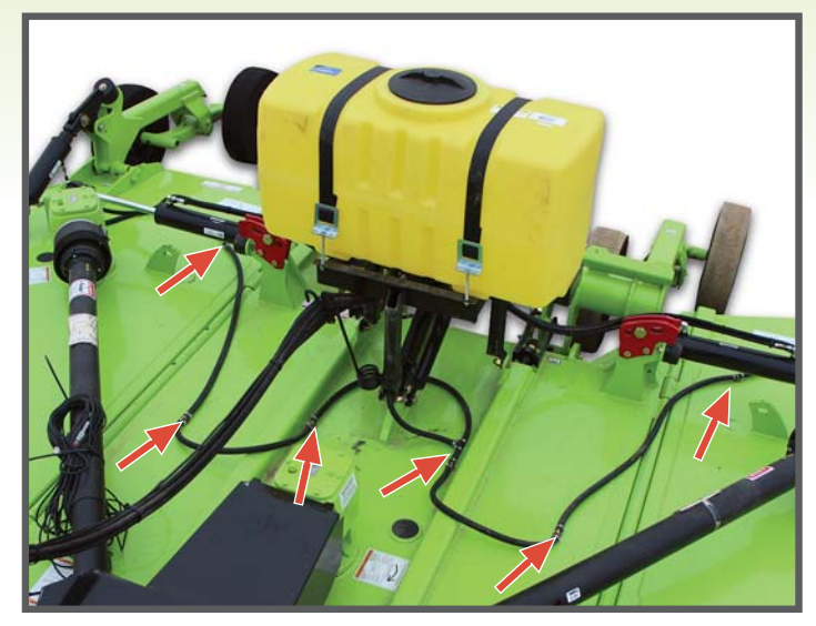
- Arrows Indicate Spray Nozzles -