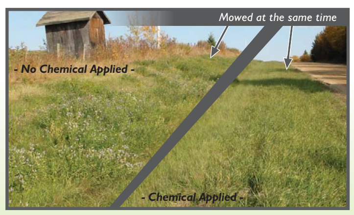
- Herbicide is applied under the mower deck during the cutting application -