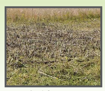
- Brush Suppression -