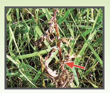
- Weed Suppression -