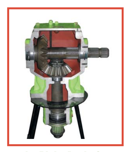
210hp Right Angle Gearboxes Heavy Duty 1 3/4" Input Shafts. 2 3/8" Tapered and Splined Down Shafts. Five year limited gearbox warranty.