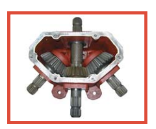
260 Splitter Box with 1 3/4" splined shafts for maximum strength.