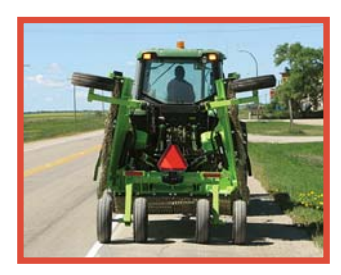
Ultra narrow transport width