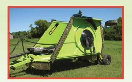
Stump jumper pan unit shown above

The FX-315 can be equipped with stump jumpers or Schulte exclusive Fixed Knife System, Forklift, Aircraft or Laminate tires. Optional double chains front and rear, full belting front and rear, residue distribution tailboard or a combination there of. Optional 540 rpm Equal Angle Hitch or 540 or 1000rpm CV driveline, deck protection rings and variable position shrouding, safety light kit.