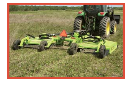
Do it all with the fixed knife system, including crop residue shredding & pasture maintenance.