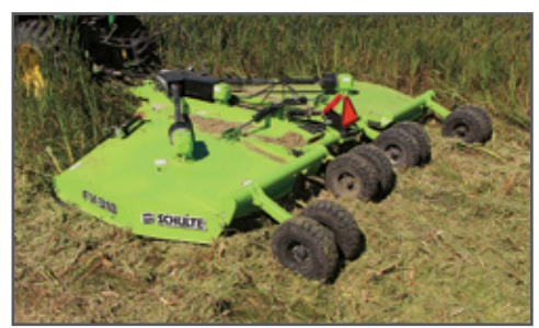
FX-318 fixed knife unit in cattails