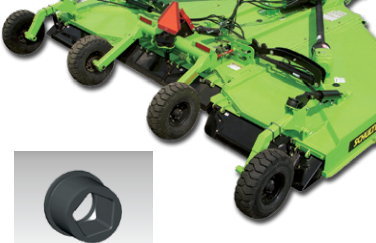
Pentagon blade bolt for maximum protection

Variable position shrouding allows you to change material flow underneath your cutter to maximize shredding and distribution.