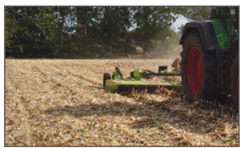
FX-315 fixed knife unit in corn