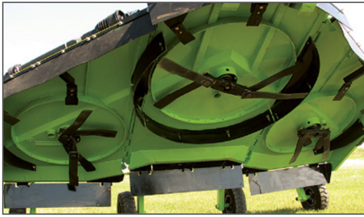
FX-315 fixed knife layout