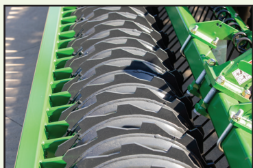
ACTIPACK ROLLER with or without leveling knives