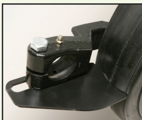
GAUGE WHEEL SCRAPERS