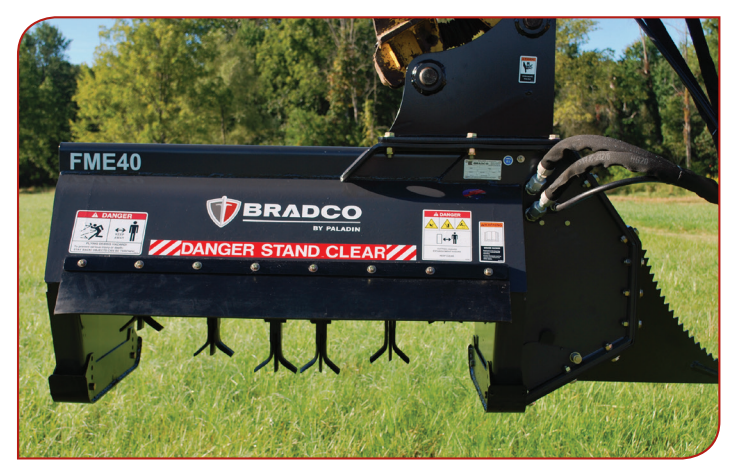
FME40 Heavy Duty Flail Mower 6-10 ton excavator (5000 psi max)