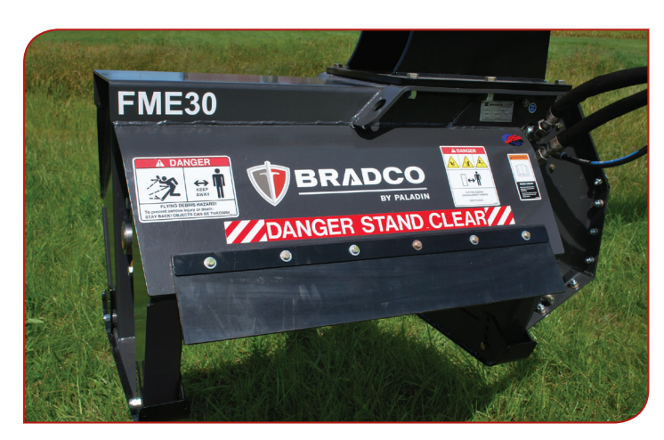
FME30 Light Duty Flail Mower 3-6 ton excavator (4000 psi max)