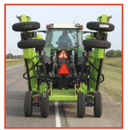
- Narrow Transport Width -