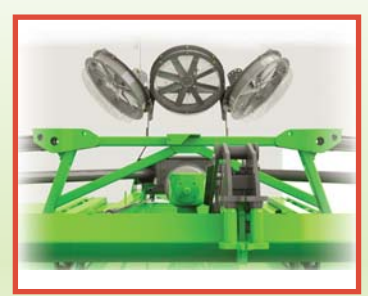
- Optional Deck Debris Fan Kit -