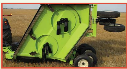
- Fixed Knife unit shown -

* Divider box has 1.75" 20 spline input and output shafts. * Down boxes have 1.75" 20 spline input shafts and 2.375" down shafts.