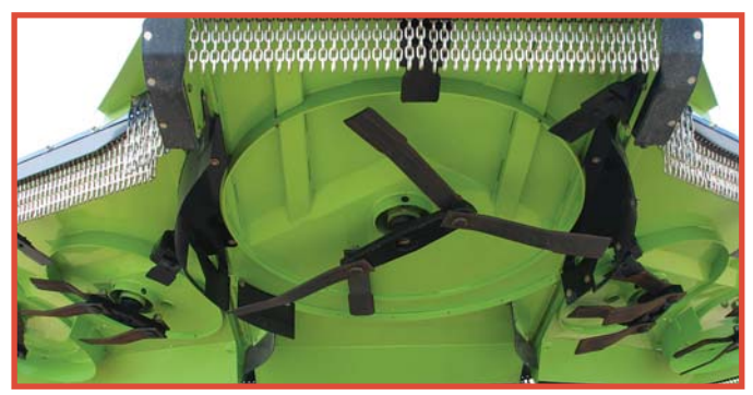
Stationary Fixed Knife system and strategically placed baffles ensure proper chop and spread