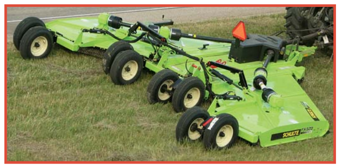
Tandem Walking Axles work great for Highway & Roadside mowing