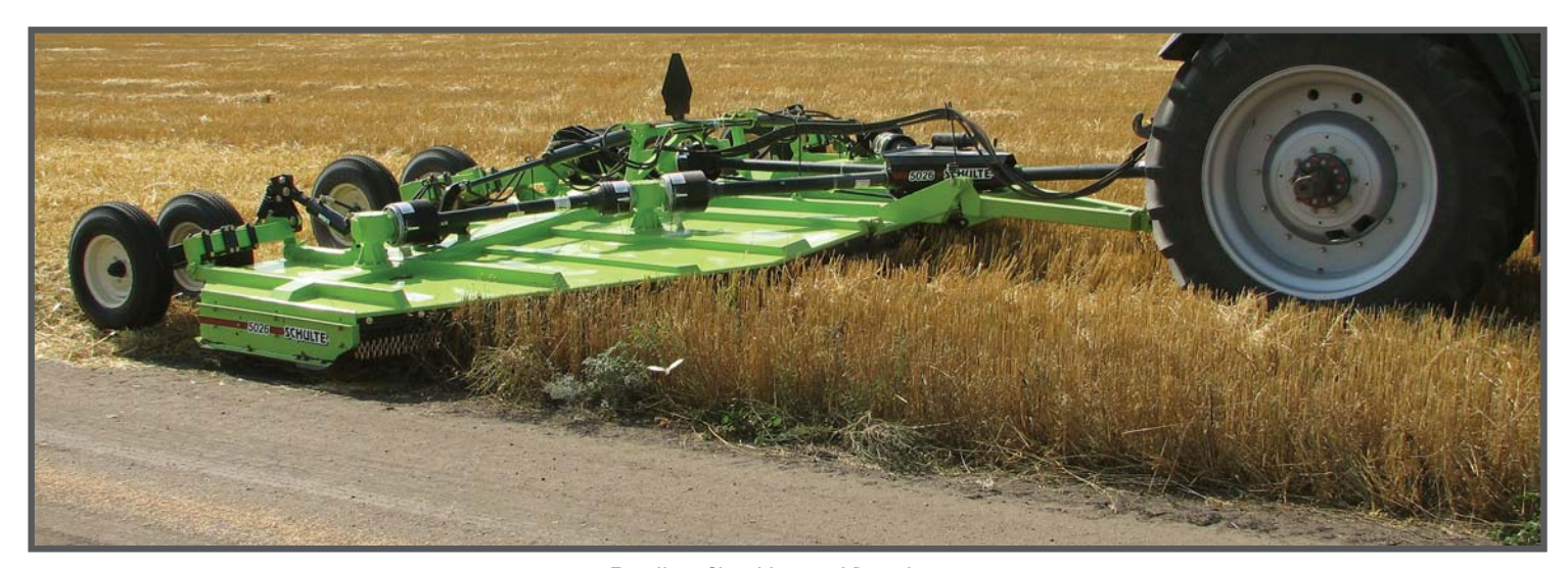
Excellent Shredding and Distribution