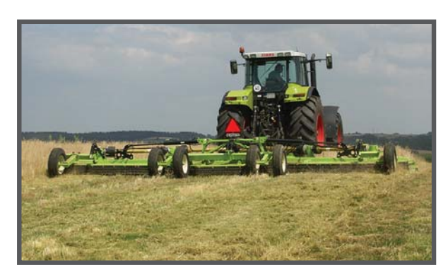
Superb Ground Following Characteristics

Over 26' of working width ensures that you get the big jobs done fast. The Schulte 5026 is designed to cut everything from light brush to crop residue such as corn stalks, wheat stubble and cotton stalks. Special blade sets are available to enhance chopping action. This machine is ideal for cutting crops like sweet clover for incorporation as green manure. The Schulte 5026 has adjustable wheel standards to fit easily into row crop spacings of 30" to 1 meter. With a maximum frame section width of 10' the Schulte 5026 does a good job of following uneven ground contours.