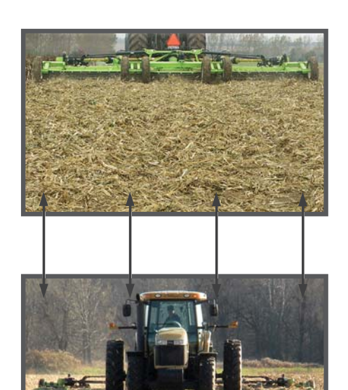
5026 in Corn