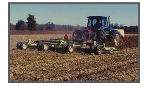
5026 in Cotton