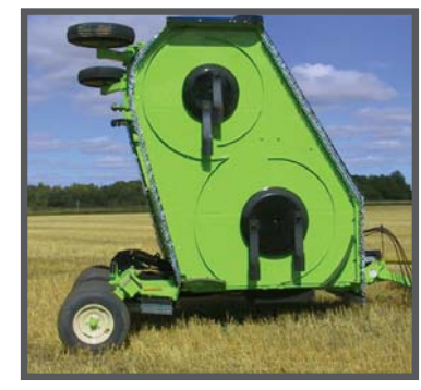
- Stump jumper unit shown (Wings Up) -