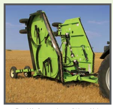
- Fixed Knife unit shown (Wings Up) -

974 RPM-15,300 ft/min (280km/hr) 812 RPM-15,300 ft/min (280km/hr) 800 RPM-15,079 ft/min (276km/hr) 15° down to 45° up 6" centre to wing (152 mm) 5" inside to outside wing (127 mm)