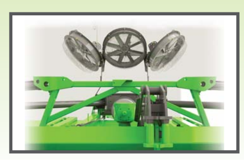
- Optional Deck Debris Fan Kit -