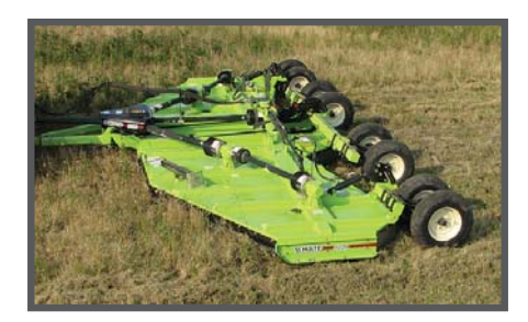
Pasture & CRP Maintenance