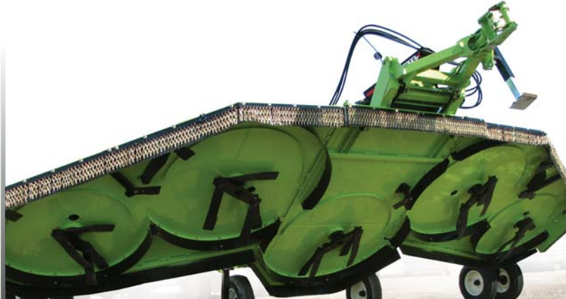
- Fixed Knife Unit Shown -