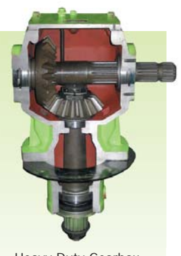
Heavy Duty Gearbox