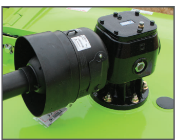
Gearbox Sight Glass

Solid laminated tires 20" or 26" • Forklift tires • 4, 6 or 8 tire options • Safety light kit • Pro Level hitch • Leveling rod (optional addition of second tension link) • 540 or 1000 RPM Drive package •