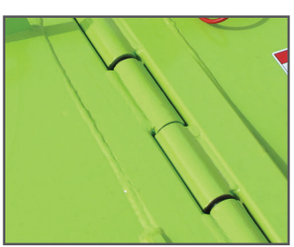
Heavy duty cast hinge line with wiper seals

Single chains front and rear • Gearbox sight glass