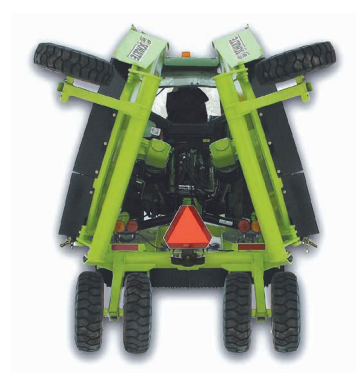
Ultra Narrow Transport Width