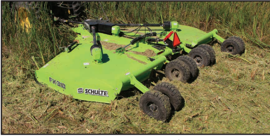
FX-318 Mowing Cattails