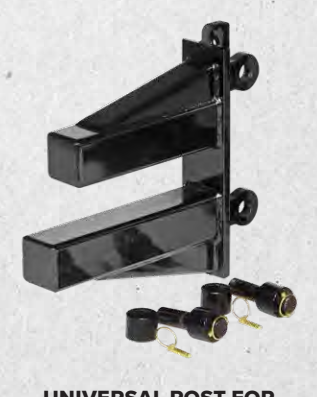
UNIVERSAL POST FOR