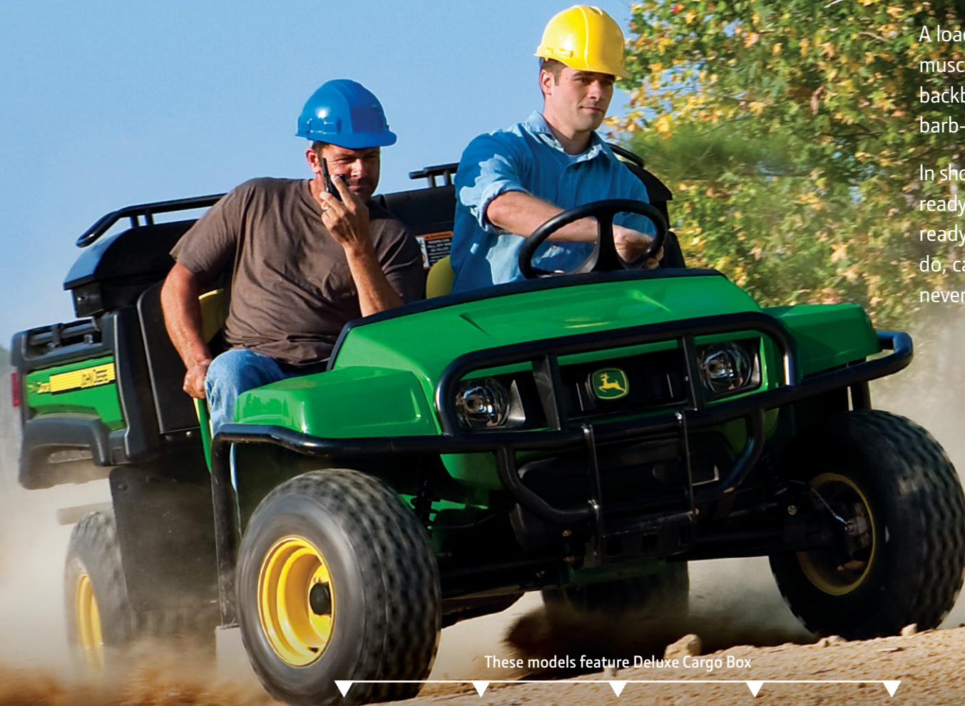
These models feature Deluxe Cargo Box

In short, you'll find our utility models are worksite-ready and anything-you-can-throw-at-them ready. They have engines that start when you do, cargo boxes that are easy to load and a never-call-in-sick attitude, just like yours.