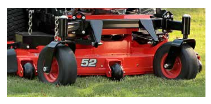
Flat-free Front Tire (Semi-Pneumatic)

Adjusting the cut of height is as simple as removing and setting the quick pin to the desired cutting height.