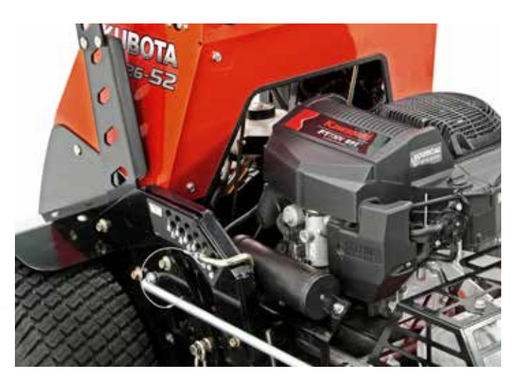
Quick Pin Cutting Height Adjustment

To easily access the adjustable dampeners, unbolt the 4 bolts to remove the front panel of the control tower.