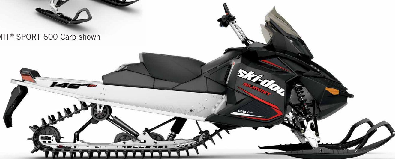
SUMMIT® SPORT 600 Carb shown