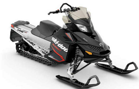
SUMMIT® SPORT 600 Carb shown