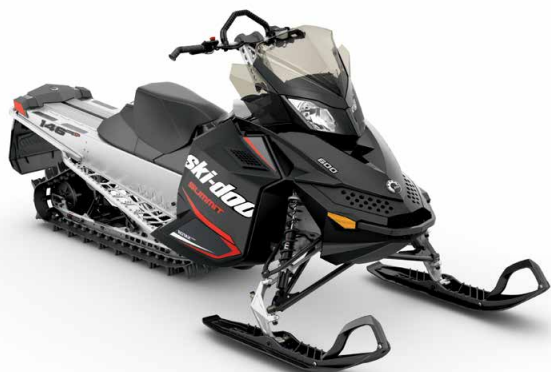
SUMMIT® SPORT 600 Carb shown