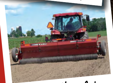
Agricultural & Landscape Seeders