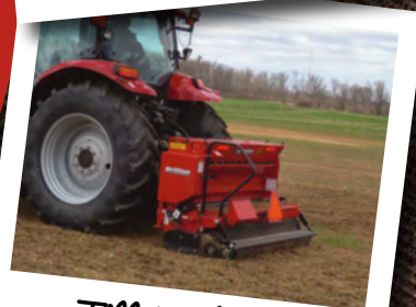
Till 'N Seed®