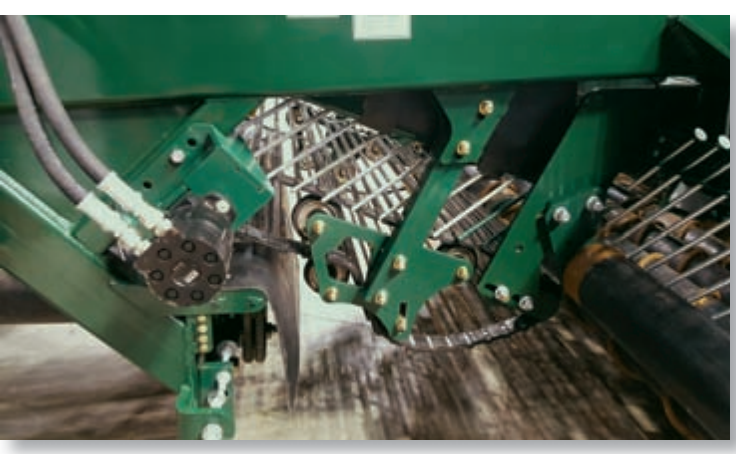
Frameless Short Transfer Conveyor — Single 60 in. wide chain greatly reduces mud build-up.