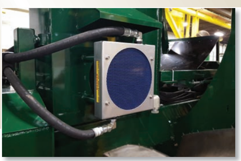
Hydraulic Oil Cooler — Tank mounted oil cooler with auto-reversing fan.

4 pair (8 rolls) with single point adjustment on front and rear. Individual cushions for rock protection.