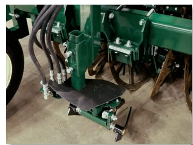
Outboard Mounted Hydraulic Row Finder provides better visibility.