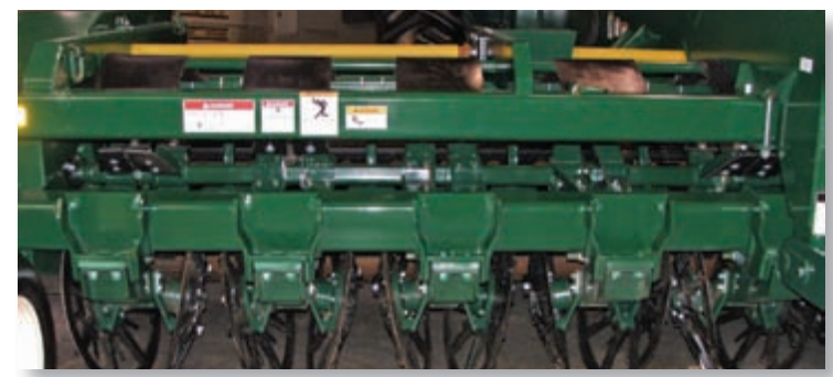
Heavy Duty Strut — 5/16 in. thick material. Improved rotation with spindle compensation for optimum placement. Standard or cushion flex.