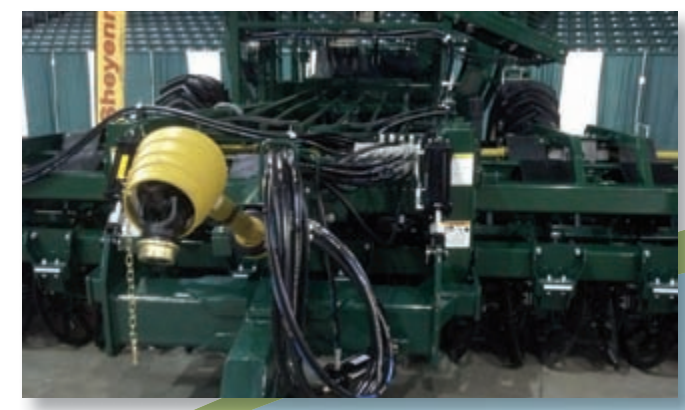
Improved hydraulic circuit. Junction blocks eliminate leak points.