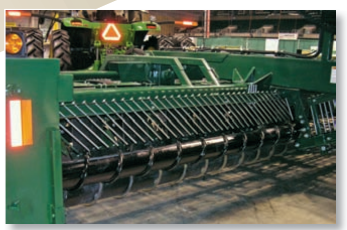
Conveyor Rolls — 4 roll conveyor with 7/8 in. diameter spiral. Fully adjustable. Dual 5 band 5V drive belt on wide heads. (Rear grab roll optional shown)