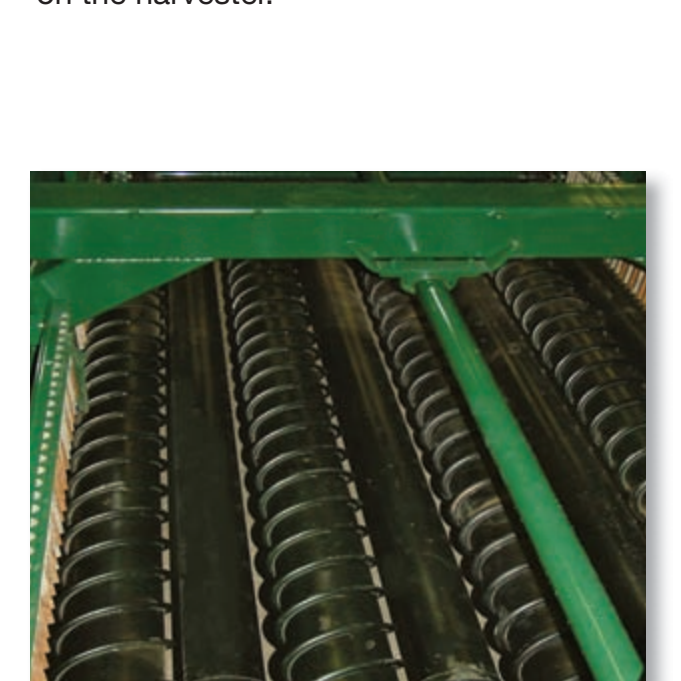
Grab Roll Bed

There is no complex valve and control box on the harvester.