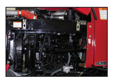
Engine - left side view