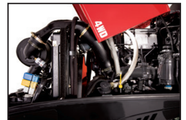
Engine – left side view