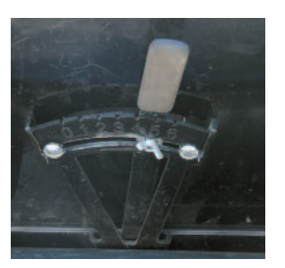
Seeder level controls proper amount of seed released.