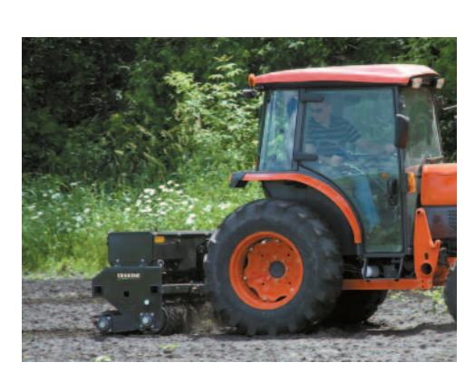
Turn your tractor into a turf and landscape seeding machine.

The Landscape Seeder, a bi-directional seeder, is built to handle all turf and landscape seeds. Grass seed is a very expensive commodity. Notched rollers properly place the grass seed in the top 1/2" of a properly prepared seedbed, resulting in maximum seed germination. Seedbed is left smooth and firm with small stones pressed down. Because of this precision placement seeding rates can be reduced up to half of the rates previously used.