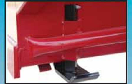
Carbon Steel adjustable skid shoes (optional)