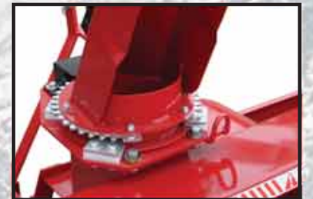
Chute rotation on polyethylene UHMV