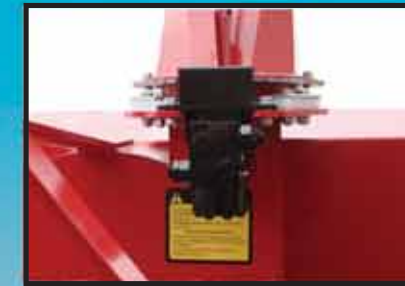
Hydraulically-powered chute rotation (optional)

(C) Discharge corrector allowing increased snow flow.