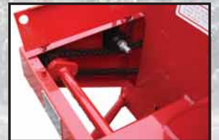
Safety bolt on driving shaft and chain bender