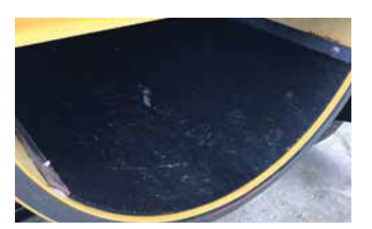
POLYMER LINER. The polymer liner inside the debris tank on the bottom half makes for efficient dumping and cleanout.