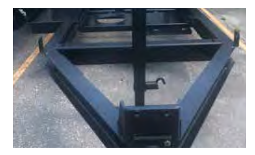
I BEAM TRAILER. Units are built from start to finish at our factory, including the trailer which consists of a sturdy I beam construction.