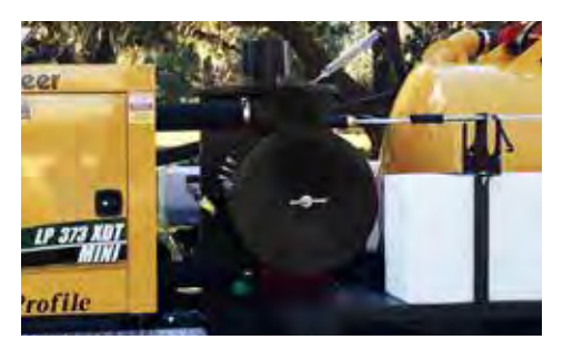
CVS (CYCLONE 4-WAY VALVE SILENCER) FILTRATION SYSTEM. .5-micron filtration. The CVS filter housing also contains the 4-way valve for reverse pressure and an oversized silencer for quiet operation. The silencer is located inside the 28-in (71-cm) diameter cyclone.