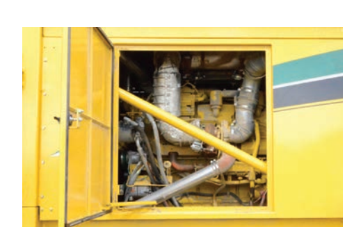
ENGINE POWER. A C27 Tier 4F engine provides 950 hp (708 kW) of power to meet your jobsite demands.