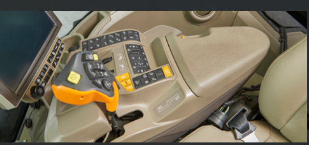
Boom Fold Multi-Function Handle & CommandARM<sup>™</sup> Integration

The closed center hydraulic system maximizes efficiency by only using the power needed for application. The AB200DS connects to the chassis's on board hydraulic system through four hydraulic hoses (pressure, return, load sense and case drain). This makes it easy for a quick swap over when combined with a wet system.