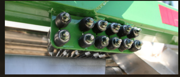
Easy Access Grease Banks

Intuitive boom fold controls are integrated into the John Deere cab control system. The fold commands match the wet system to simplify the use and reduce operator training time. The integrated controls allow the operator to independently fold right or left booms or fold both booms all through the multi-function handle.