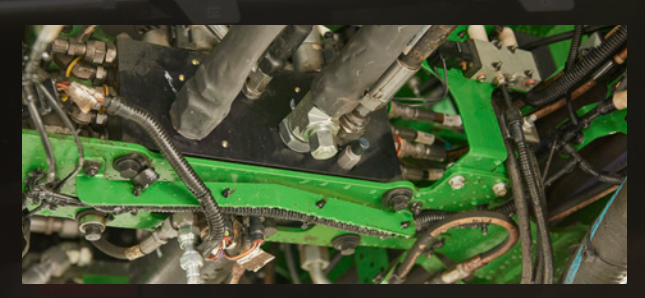
Closed Center Hydraulic System

The AB200DS hopper can be equipped with an electrically controlled tarp. The tarp can be opened and closed from the cab using controls in the GreenStar 4600 CommandCenter<sup>™</sup> or can be operated using the wireless remote included with the system.