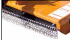
Optional chain shielding for added protection from thrown objects