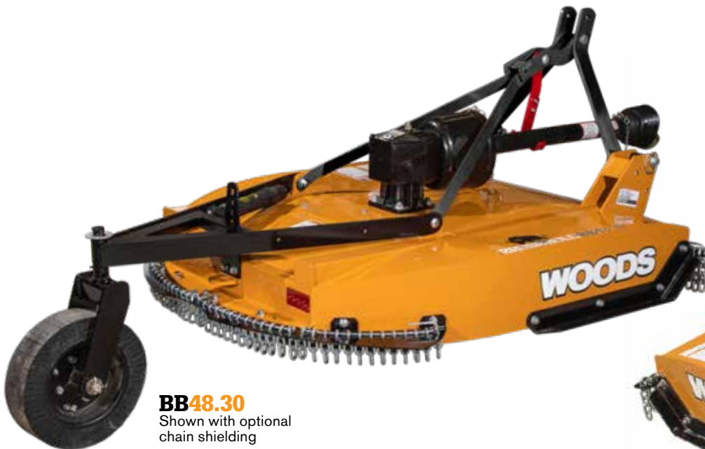
BB48.30 Shown with optional chain shielding