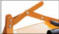
Breaklink allows cutter to float and follow terrain for better cut quality