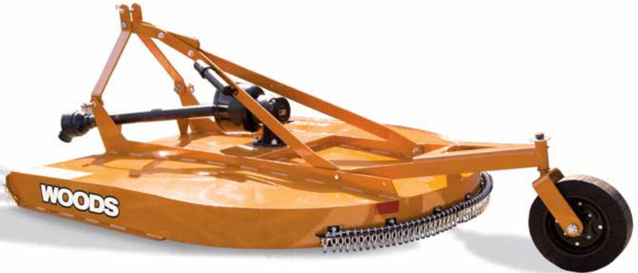
RC72.20 shown with optional chain shielding

Woods' RC-Series Single-spindle is ideal for getting the most from your compact or subcompact tractor. Built with high-strength steel, Woods confidently stands behind this product with our three-year gearbox warranty.