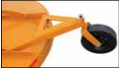
Strong, fabricated tail wheel assembly with solid, laminated tire