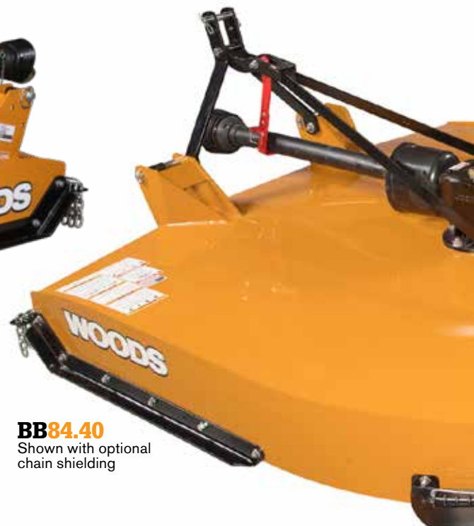
BB84.40 Shown with optional chain shielding