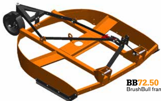
BB72.50 BrushBull frame