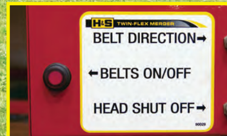
5128 CONTROL BOX