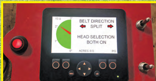
6128 CONTROL BOX