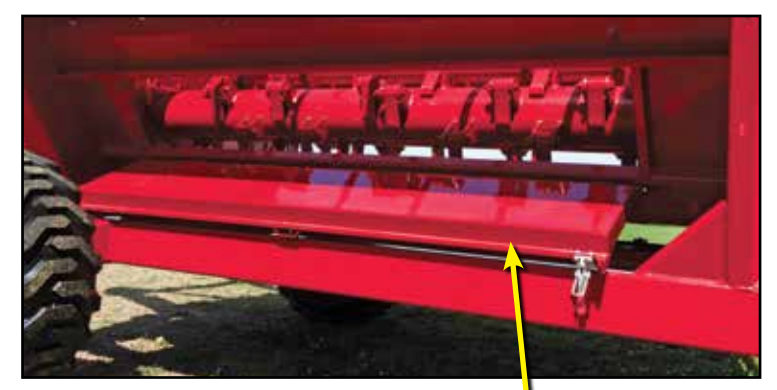
Remove twine through the easy access door, opposite of the discharge.

The Bale Processor's cradle system constantly and evenly feeds the hammers. Unlike systems that must unroll the bale before shredding, the unique hydraulic cradle rocks bales over the hammers, so the entire cross-section of the bale can be shredded at once.