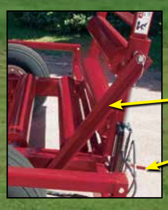
• The tailgate has a transport bar to lock the tailgate.

• A hydraulic shutoff valve that must be closed for transport.