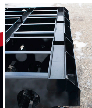
RAMP DESIGNED TO CARRY EXTRA CARGO Groove fits 4x4 board