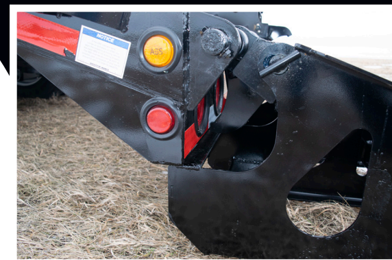
DOUBLE HINGE RAMP with built in stabilizer