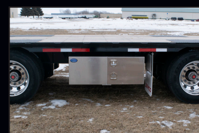
TOOLBOX Located between wheels on spread axle or up front on closed, tandem, and triple axle