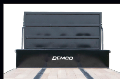
FRONT BULKHEAD Removable