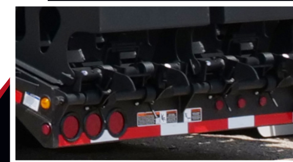
4 SPRINGS PER RAMP 2 springs assist in raising and 2 springs assist in lowering