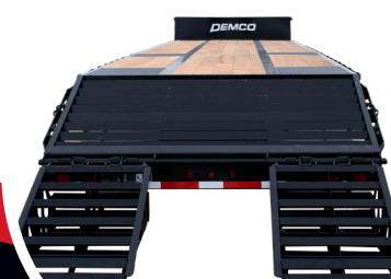
Several Sizes lengths of 40'-53'