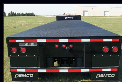
STEEL FLOORING 48' & 53' no beavertail