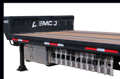
UPPER RAMPS Removable - Rated 5K each, 10K total