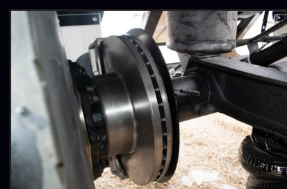
DISC BRAKES Air ride suspension only