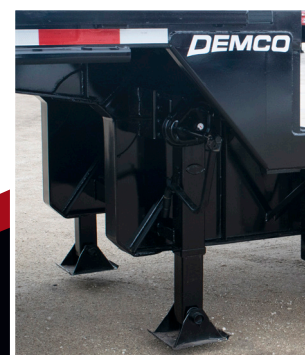
HOLLAND ATLAS 55 LANDING GEAR