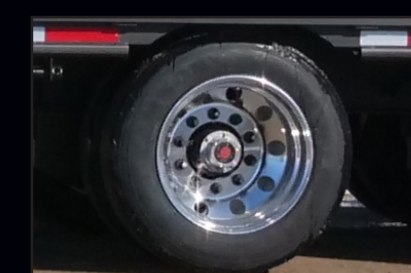
ALUMINUM RIMS Steel rims are standard