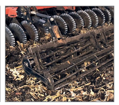
24/7® HD DOUBLE REEL

This 3-row tine harrow with 5/8" x 30" tines on 12" spacing with adjustable tine bar angles is well suited for lighter the primary function is to position the cut residue parallel to the field surface.