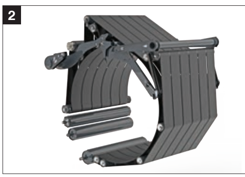
6 belt, 3 roller design of the bale chamber ensures fast, consistent bale formation in any crop condition