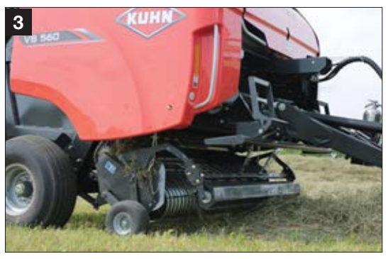
90" wide pickup with 5-tine bars to collect all the crop every time