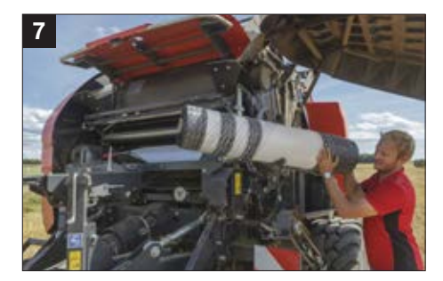
Support brackets for easy loading of the net roll

CHOOSE FROM 3 INTAKE OPTIONS TO MEET YOUR OPERATION'S NEEDS