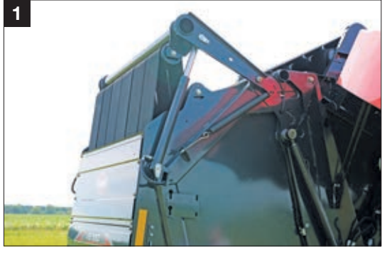
Twin tensioning arms provide higher density from improved belt tension control and response time.