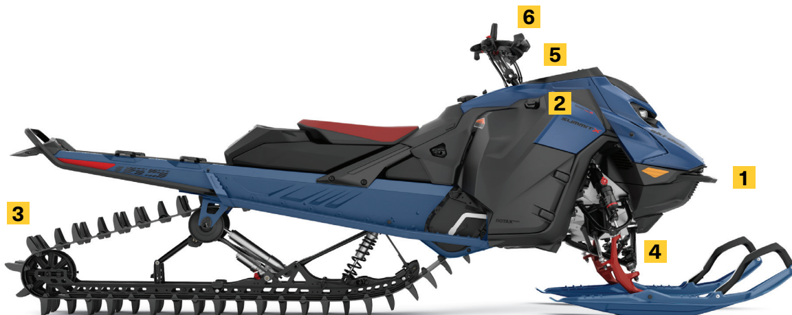
SUMMIT X WITH EXPERT PACKAGE 165 850 E-TEC TURBO R SHOWN

This lighter, redesigned 16-in. track unique to the Expert package, has a stiffer edge that compliments the fixed rear arm of the tMotion XT for more rigidity in the rear skid.