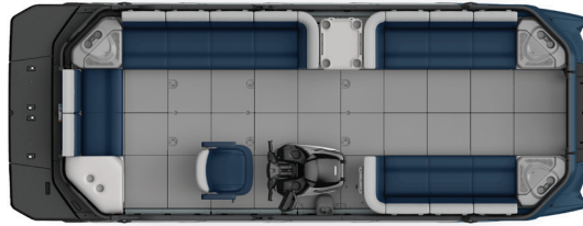
SWITCH CRUISE LIMITED 21 - 230