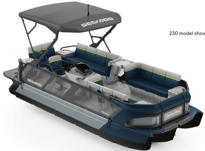
230 model shown