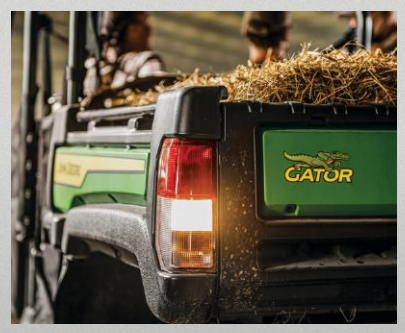
Cargo box lights and liner Let everyone see where you are in dark and early dusk with rear brake and taillights. Standard spray-in cargo box liner keeps your hardworking cargo box looking new..