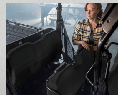
Extra Cargo Space with Folding Rear Seat We don't sacrifice storage capacity to carry more passengers. Flip up the rear seat bottom, there's plenty of storage underneath. Not hauling anyone? Fold down rear seat back and carry extra cargo.