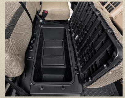
16 gallons (over 60 l) of storage Glove box is perfect for sunglasses and work gloves. Under-seat storage can be loaded up with a small toolbox, lunch and even extra cargo straps.