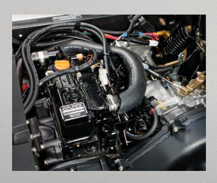
Engine 54-hp (40.3 kW) gas-powered with three cylinders, 12 valves and Dual Overhead Cams (DOHC) deliver the power and torque to get the job done. Electronic Fuel Injection (EFI) self-corrects for altitude from base camp all the way to the summit.