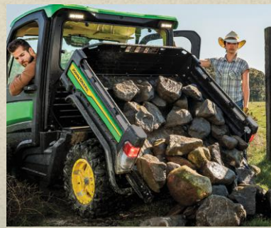
Cargo Box Power Lift Empty your load with the flip of a switch, the Gator XUV does the heavy-lifting for you. When the load is empty flip switch again to put down the cargo box.

Enjoy instant 4WD traction with the flip of a switch, and when the going really gets tough, flipping the switch to lock the rear differential is just as easy.