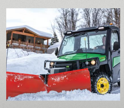
Cold Weather Starting No matter the temperature outside, the XUV835 is ready. It has been tested to quickly start in -20 degree Fahrenheit (-28.9 degrees Celsius) temperatures—proving it's part gator, part abominable snowman.