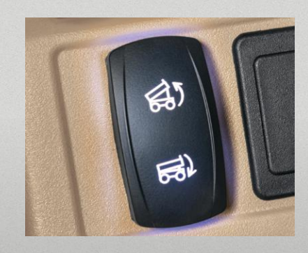
Cargo Box Power Lift Effortlessly raise and lower the cargo box, from the comfort of your seat, with a flip of a switch. Standard on all R-Trim Models and optional on others.