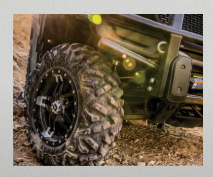
Automotive Style Braking Massive twin piston hydraulic disc brakes bring you to a complete stop. The single piston rear brakes help you stay in control.