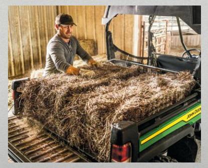
More People. More Gear. No Problem. Keep gear secure and make loading easier. Tie down bars on the cargo box sides work well with the 14 different tie-down points. Remove the cargo box sides and convert to flatbed mode.