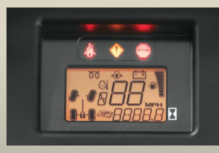
Easy-to-read dash panel lets you quickly scan your speed, gear position, and now, fuel level.

*The engine horsepower and torque information are provided by the engine manufacturer to be used for comparison purposes only. Actual operating horsepower and torque will be less. Refer to the engine manufacturer's web site for additional information.