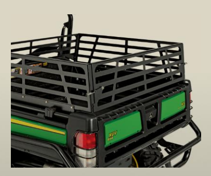
Optional Box Side Extensions increase the amount of light material you can haul such as clippings and mulch when compared to a base model cargo box. Tailgate pivots at the top for ease of unloading loose material.