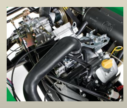
Power under the hood delivers exceptional torque, great low-end lugging power and fast acceleration everywhere you go.

Step up to the Gator<sup>™</sup> TX. This top of the line two-wheel drive boasts intense horsepower and a Deluxe Cargo Box that's equal parts versatile and invaluable. While tuned four-wheel suspension and high-back seats mean comfort comes standard. And no matter if you're towing a full load or not, its hydraulic disc brakes deliver a quick stop and a standard rear receiver hitch makes towing a breeze.