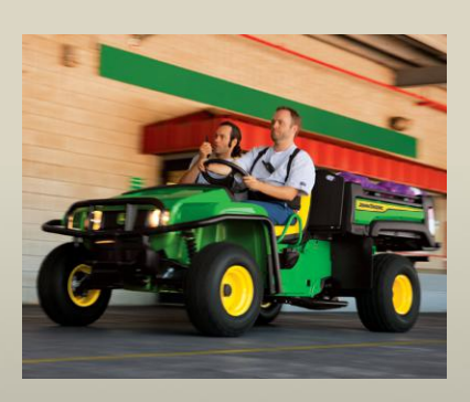
No matter what you haul, the Gator<sup>®</sup> TX delivers a smooth ride, courtesy of its four-wheel suspension with coil over shock, triple-rate adjustable springs.