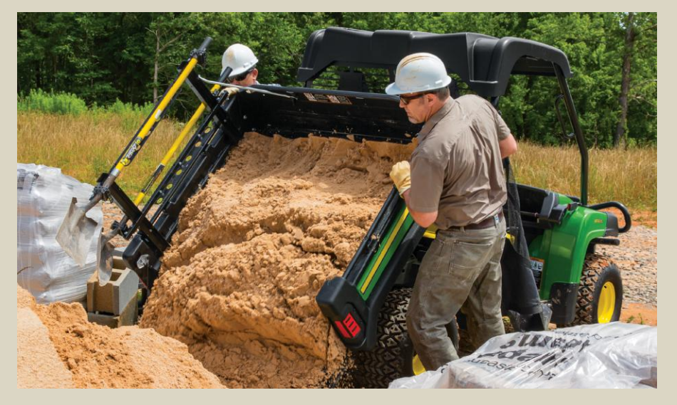
Generous Cargo Box is built with tough, composite materials. Its 16.4 cu. ft (.56 cu. m.) can handle 1,000 lb. (450 kg) easy.