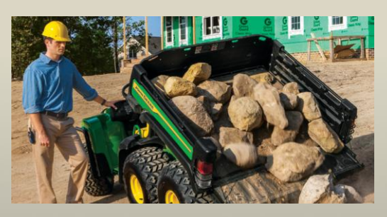
Every brake system is precisely matched to the vehicle load capacity. Stop with confidence.