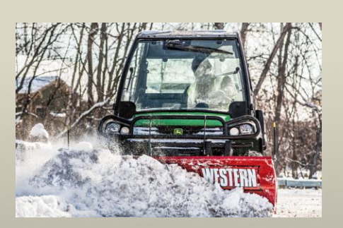
Keep your 4WD Gator UV working year round with a powerful front blade to help you clear the way during winter's worst.