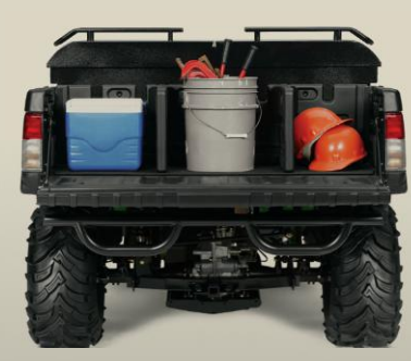
Optional cargo box dividers let you reconfigure and organize your load in a few minutes without tools.

*The engine horsepower and torque information are provided by the engine manufacturer to be used for comparison purposes only. Actual operating horsepower and torque will be less. Refer to the engine manufacturer's web site for additional information.