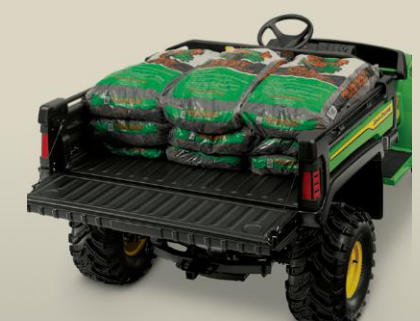
Cargo box has 16.4 cu. ft (.56 cu. m.) of capacity, a pick-up style tailgate, 20 tie-down points and a gas-assist shock for easier lifting and dumping.