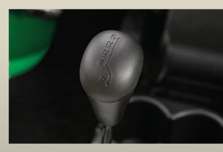
Shift Control Lever with an integrated park position. There's no more releasing a separate park brake. It's our smoothest shifting Gator" UV yet.