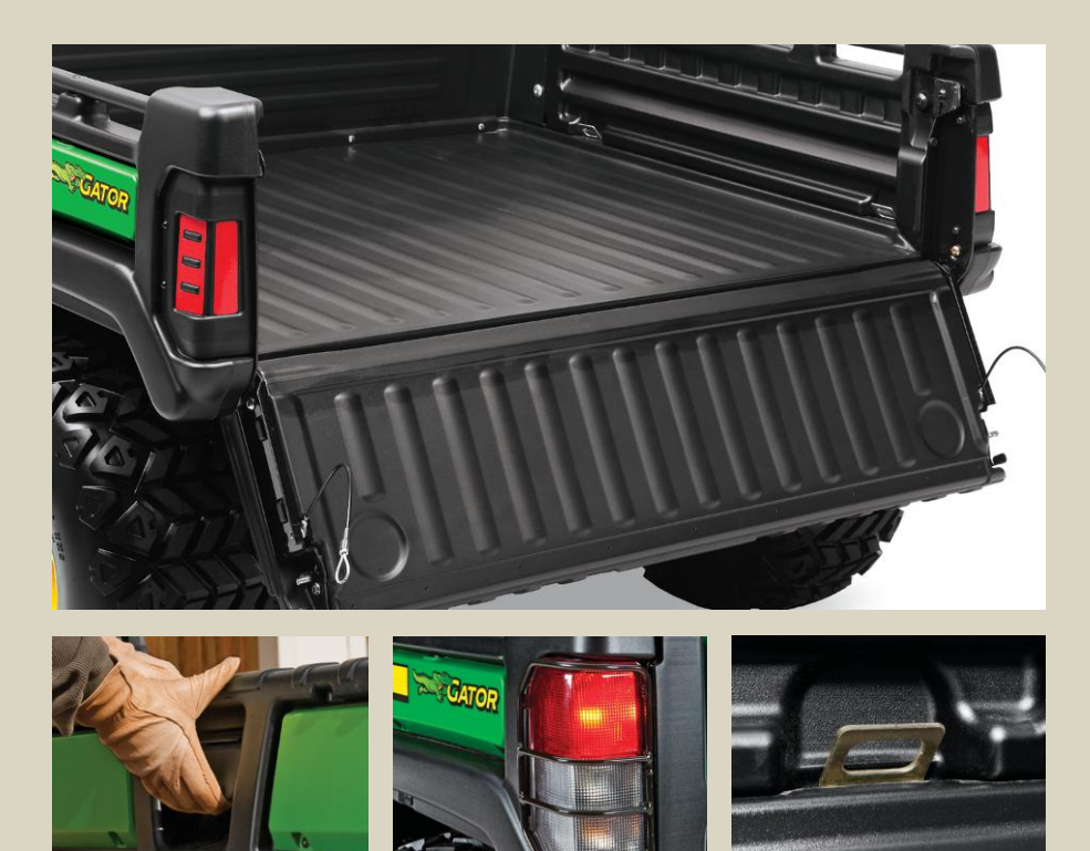
Pick-up style tailgate folds out to 90 degrees, and down a full 150 degrees. Protect your investment with a factory-installed spray-on bedliner. Optional brake/tail light kit helps you stand out on the worksite. Tie-down points let you secure cargo.