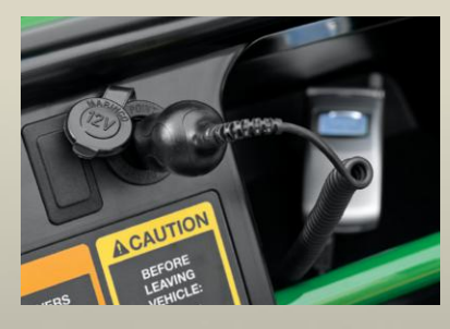
12-volt DC outlets The same kind you'll find on most Gator<sup>®</sup> UV's are similar to the ones in boats and trucks. Keep your phone charging at all times.

Our Gator<sup>®</sup> Work Series loves work as much as you do. Because they're equipped with our Deluxe Cargo Box that shines under heavy stress and extreme conditions. These are the time-tested models that crave a full load, stop with dead-eye precision and deliver an intense bang for your hard-earned buck. Gas, diesel or electric, pick the Gator<sup>®</sup> UV that's right for you. And let's get to work.