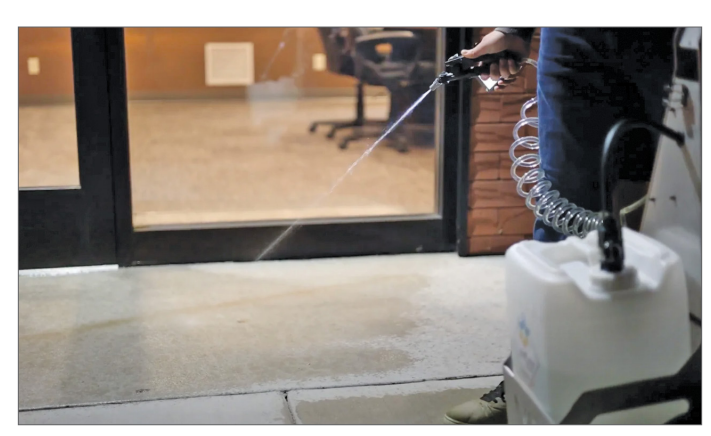
The Push Pal's easy-to-use spray wand allows for both fan tip and pencil tip application of liquid solutions.

Heavy-Duty Stainless Steel Construction provides corrosion resistance and long-lasting performance.