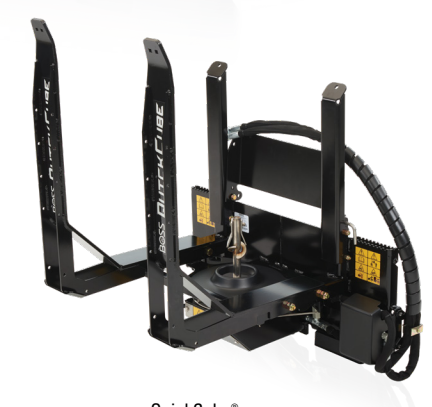
QuickCube® Spreader Attachment