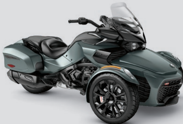
Mineral Blue Satin model shown