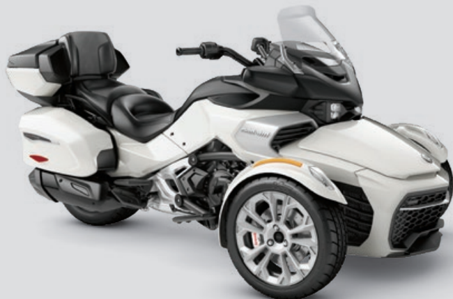
Pearl White model shown