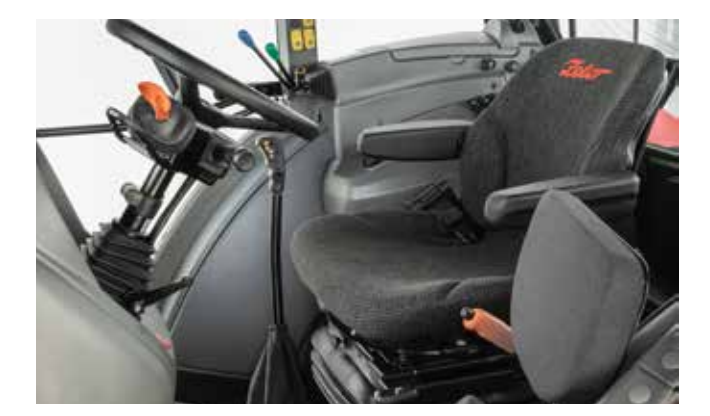
All FORTERRA models can be optionally equipped with cab suspension system to maximize operator's comfort.