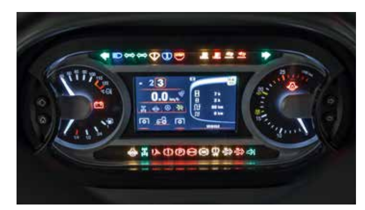
Completely new dashboard with color display improves clarity and awareness of information given to the driver. All important data are placed in one place.