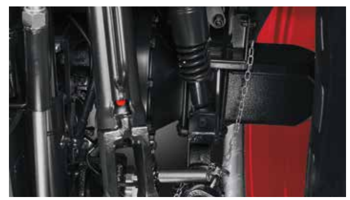
The front driven axle of the FORTERRA HSX and HD models can be optionally suspended. In combination with the suspended cab, this offers a smooth and comfortable drive.