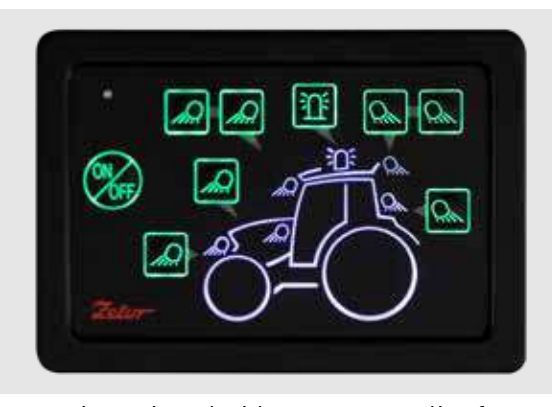
The tractor is equipped with a new controller for controlling work lights and beacons. It offers a number of advanced functions such as automatic activation of work lights according to the selected driving direction or a memory function.