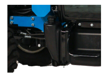
Ground Level Fueling Provides Easy Access