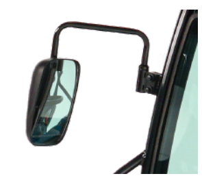
Standard Dual Mirrors Provide Added Visibility