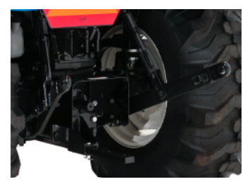
Standard Drawbar Provides Value And Enables Trailering etc.