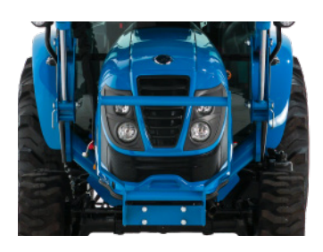
Standard Grille Guard With Loader Provides Added Protection