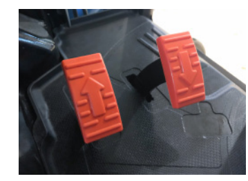
3 Range Hydrostatic Transmission Provides Comfort And Excellent Controllability Of Tractor Movement