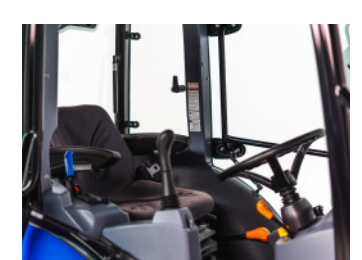
Left And Right Cab Doors Premium Seat Providing Access To Either Side Of The Cab