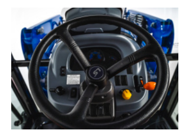
Electronic PTO For Ease Of Use