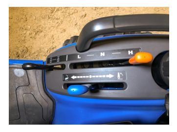
Color Coded Controls Enables Inexperienced Operators More Confidence