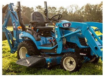
60 Inch Mower Deck Heavy-Duty Mower Deck Provides An Excellent Cut And Makes Use Of The Standard Mid-PTO