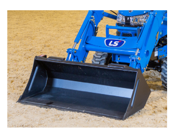
High Capacity Loader 2 Large Diameter Lift And 2 Large Diameter Curl Cylinders Enable 1,007 lbs. Lift Capacity