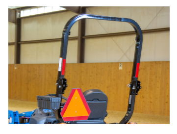
Standard Foldable ROPS Enables Easy Adjustment For Clearance