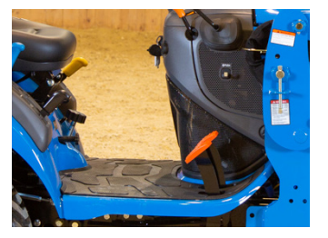
Flat Platform With Rubber Surface Provides Comfort During Long Hours