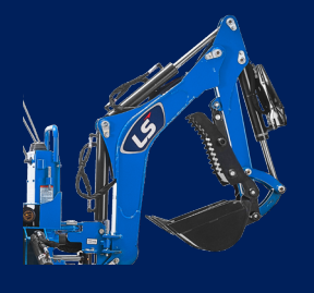
BACKHOE: Excellent Capacity, Smooth And Consistent Operation For Added Control