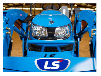
Standard Factory Grille Guard W/ Loader Full Length Grille Guard Protects Body Panels And Radiator