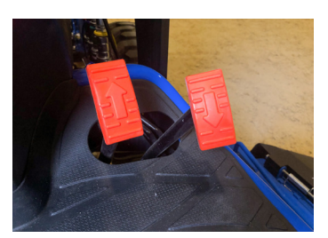
2 Range Hydrostatic Transmission (2 Pedal) Comfortable And Efficient Operator Control