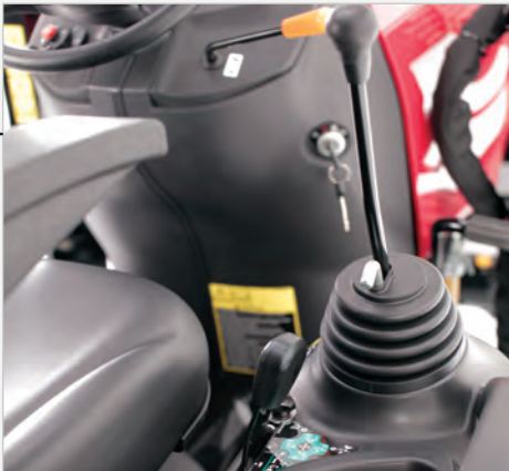
Work comfortably with armrest-mounted loader control lever, while True Position Control lever (below joystick) delivers precise operating height of rear implements.