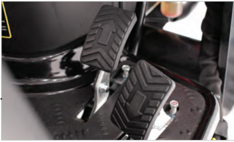
Switch seamlessly between forward and reverse with two side-by-side hydrostatic transmission pedals.