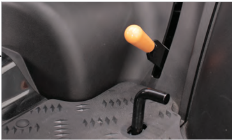
Differential lock is standard with foot pedal engagement for SA324 and SA424.