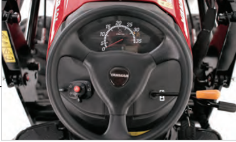
Simple to operate; easy access to every control.