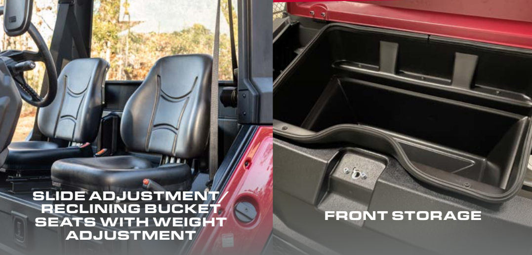
SLIDE ADJUSTMENT RECLINING BUCKET SEATS WITH WEIGHT ADJUSTMENT