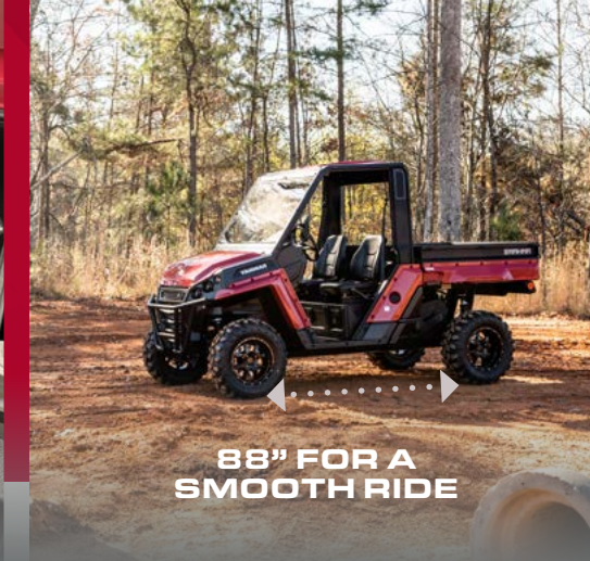
88" FOR A SMOOTH RIDE