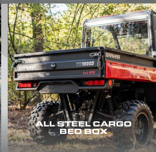
ALL STEEL CARGO BED BOX