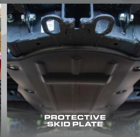
PROTECTIVE SKID PLATE