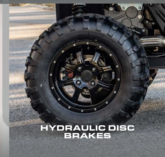
HYDRAULIC DISC BRAKES