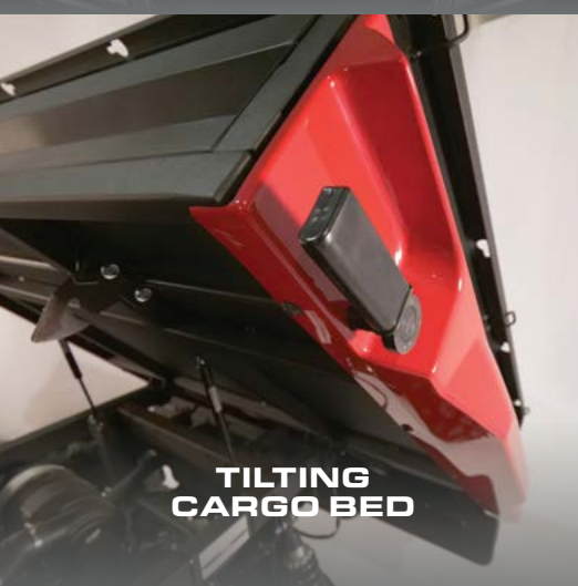
TILTING CARGO BED